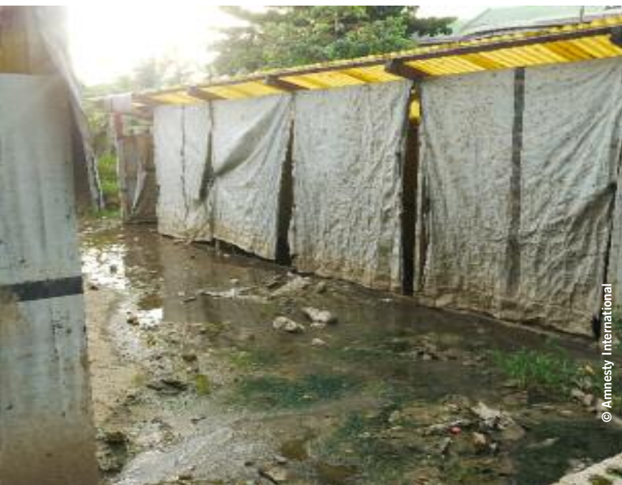
Left: Showers at Camp Grace Village, Carrefour municipality, Port-au-Prince.