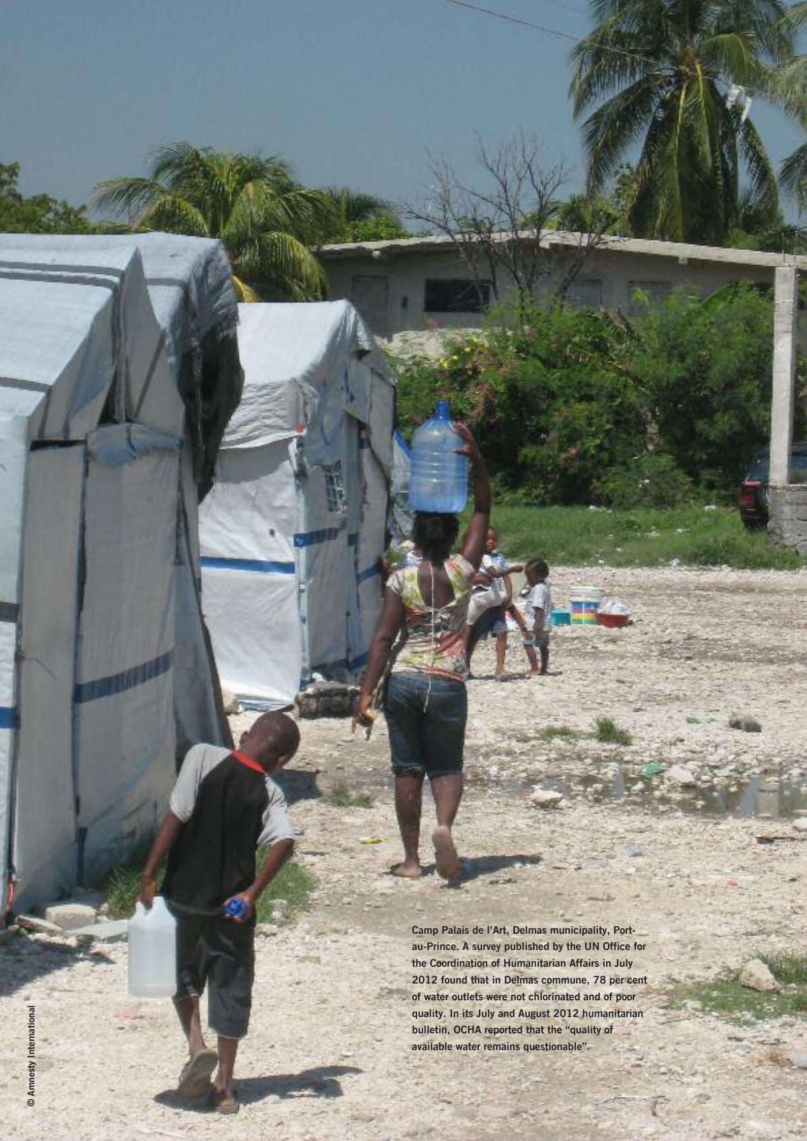
Camp Palais de l'Art, Delmas municipality, Port-au-Prince. A survey published by the UN Office for the Coordination of Humanitarian Affairs in July 2012 found that in Delmas commune, 78 per cent of water outlets were not chlorinated and of poor quality. In its July and August 2012 humanitarian bulletin, OCHA reported that the "quality of available water remains questionable".