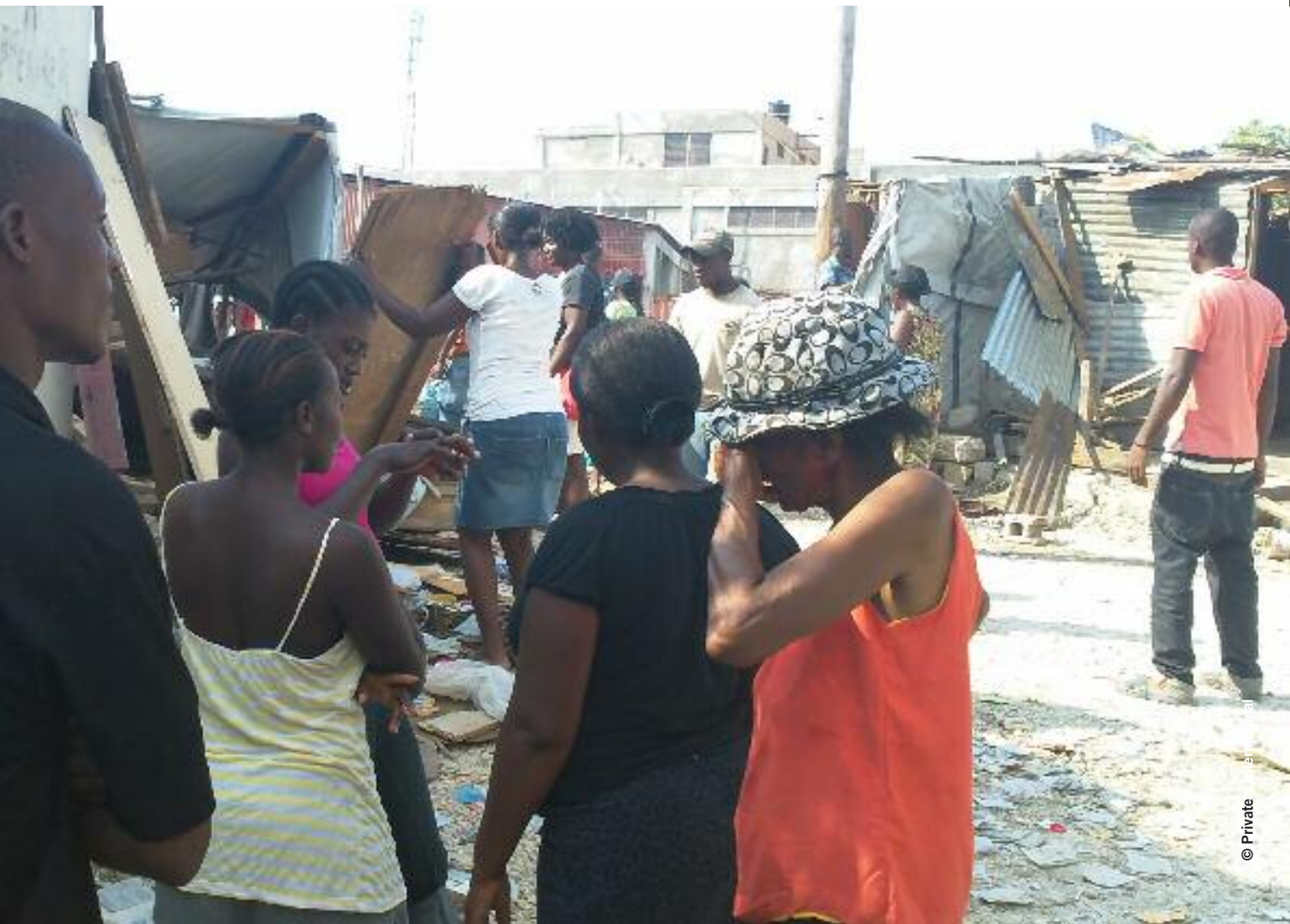
Below: People survey the wreckage of their homes in the aftermath of the forced evictions from Camp Mozayik, Delmas municipality, Port-au-Prince, May 2012.