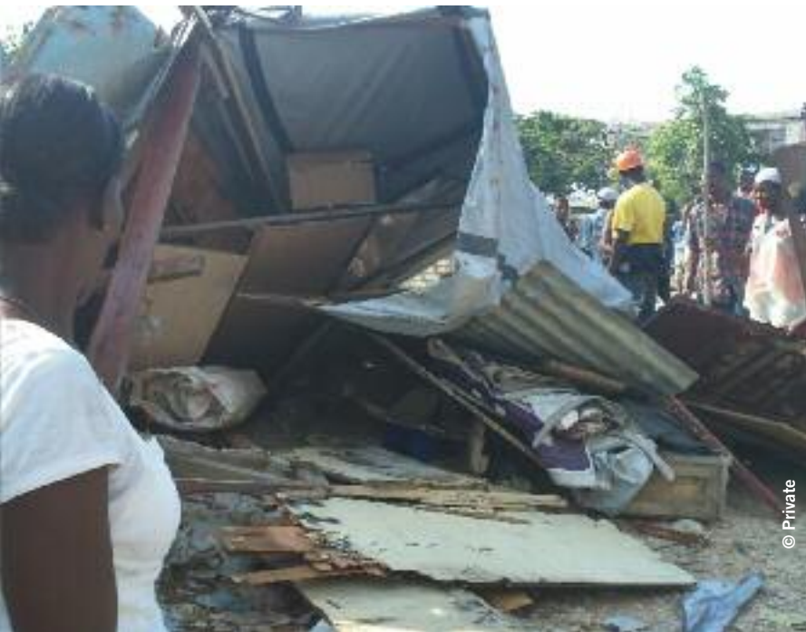
Left: Forced evictions at Camp Mozayik, Delmas municipality, Port-au-Prince, May 2012.