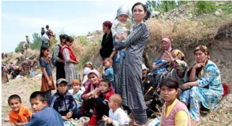
Ethnic Uzbeks seek refuge near the Kyrgyz-Uzbek border on June 12, 2010.

perceived to be the Uzbeks' newly elevated political position. In particular, Kyrgyz residents perceived Uzbek-organized rallies against Bakiyev as calls for southern autonomy.