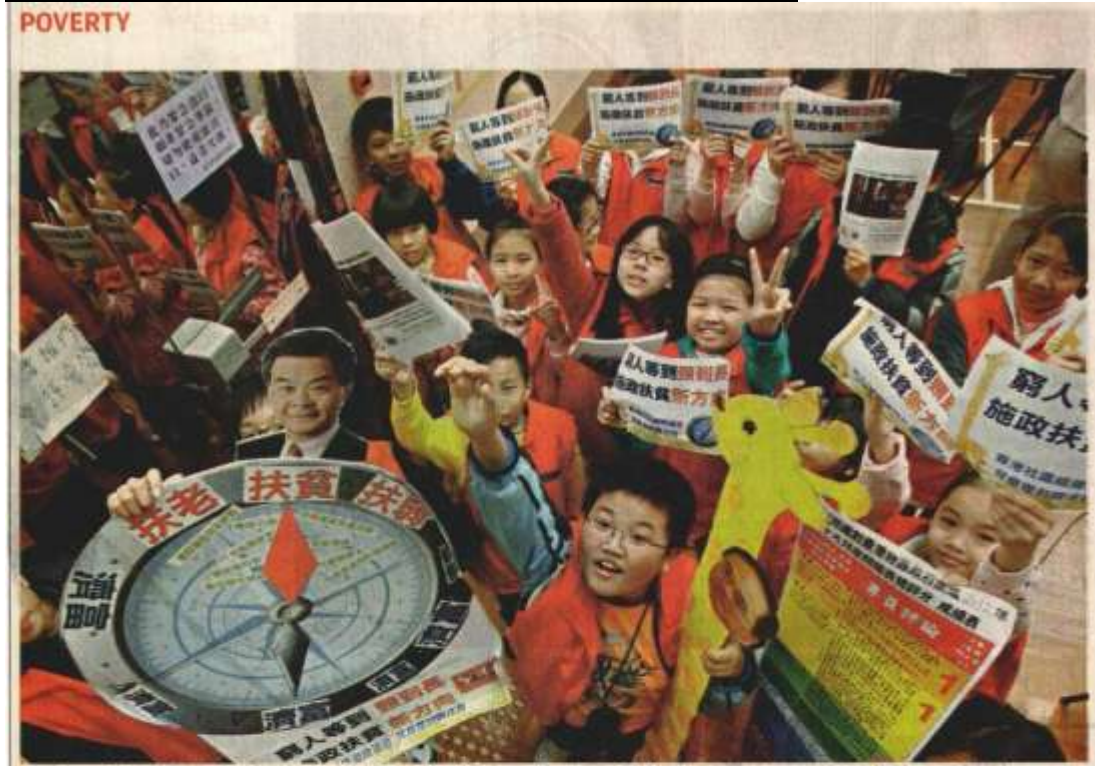
Members of the Children's Rights Association call on the chief executive to start taking Hong Kong in a new direction.

South China Morning Post (1 January 2013) (Page City 3)