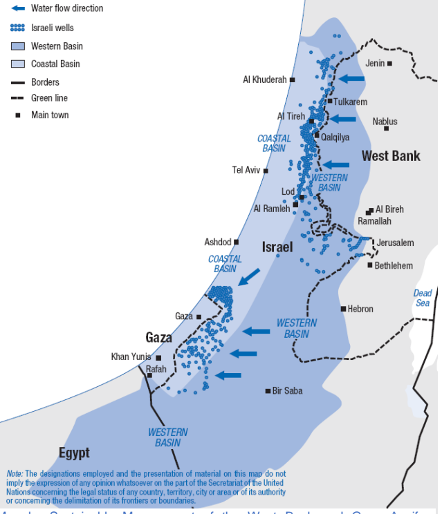
Map by Sustainable Management of the West Bank and Gaza Aquifers (SUSMAQ) project, funded by DFID and in collaboration with University of Newcastle upon Tyne and the British Geological Survey (2001–2004). Published in UNDP, Human Development Report 2006: Beyond Scarcity: Power, poverty and the global water crisis (New York: UNDP, 2006), p. 217, at: http://hdr.undp.org/sites/default/files/reports/267/hdr06-complete.pdf.

People living in the oPt have access to 320 cubic meters of water annually, one of the lowest levels of water availability in the urbanized world and well below the threshold for absolute scarcity. The unequal distribution of water from aquifers shared with Israel reflect the initial destruction