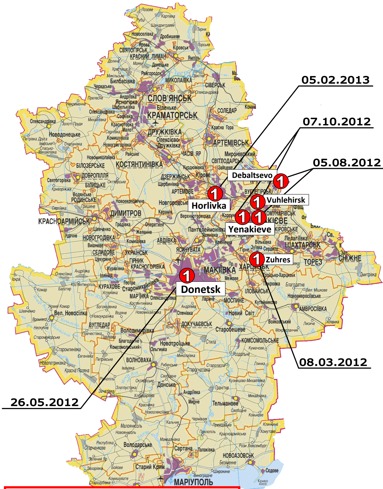
Geography of arsons of Kingdom Halls of Jehovah's Witnesses in Donetsk Region March 2012 – February 2013