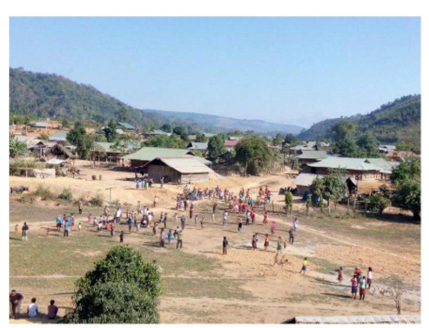
A section of Area 179, Liên Srônh Commune, Đam Rông District, Lâm Đồng Province

In many remote areas in northern provinces, Hmong Christians fare even worse because both the government and villagers jointly force them to abandon Christianity. Those who refused to do so were banished from their communities without any legal basis. Several victims asked BPSOS to submit their cases to the United Nations are members of the Evangelical Church of Vietnam (ECVN) - North, a major government-controlled Protestant organization in northern Vietnam, because their church did not speak out on their behalf.