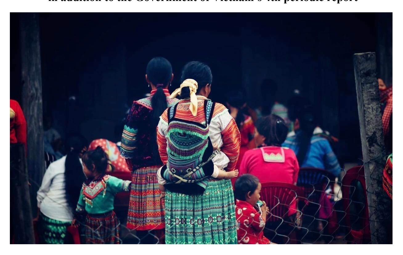
Race-based Discrimination against H'mong in Vietnam