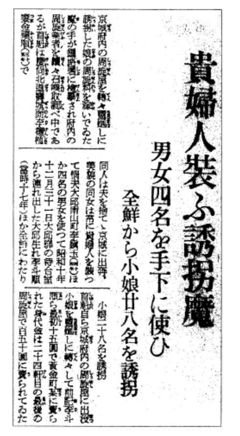
[March 1, 1938, Asahi Shimbun South Korea Edition] [Title]