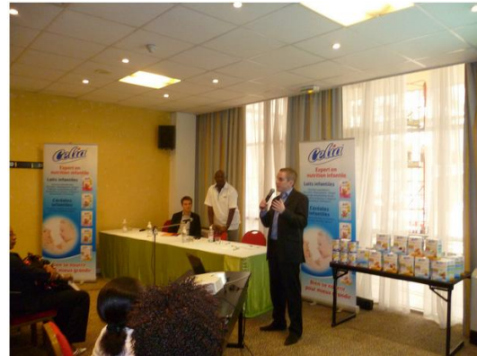
In the Ivory Coast, Celia was launched with a presentation to health professionals at a hotel.

Similarly, Novalac violated the Code by promoting its products to the public in Bosnia and Herzegovina, Croatia, France, Lebanon, Malaysia and Slovenia. Other Code violations in the form of promotion of products to health professionals were reported during a conference in London and through other initiatives across the Middle East.