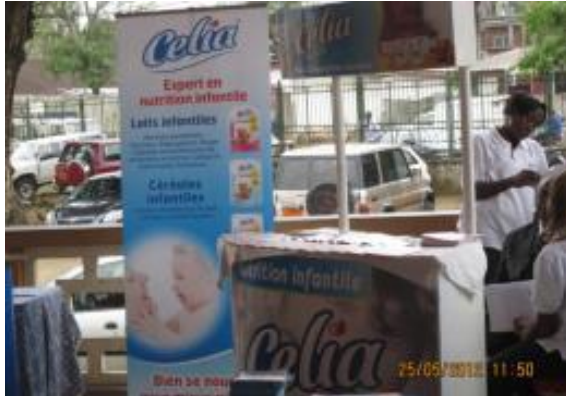
In Cameroon Booths and banners proclaiming Celia as experts in infant nutrition can be seen in a fair to commemorate International Midwives Day.

These two companies based in France have also an important responsibility in their systematic violations of the Code in several countries. In particular, the Lactalis Group , comprising many other companies acquired over the years, violated the Code provisions for what concerns promotion of breastmilk substitutes to the public in Cameroon and Lebanon, and for what concerns promotion to health professionals in the Ivory Coast, UK and Vietnam. 72