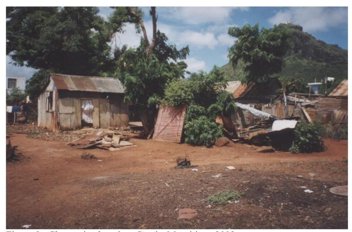
Figure 3. Chagossian housing, Cassis, Mauritius. 2002.