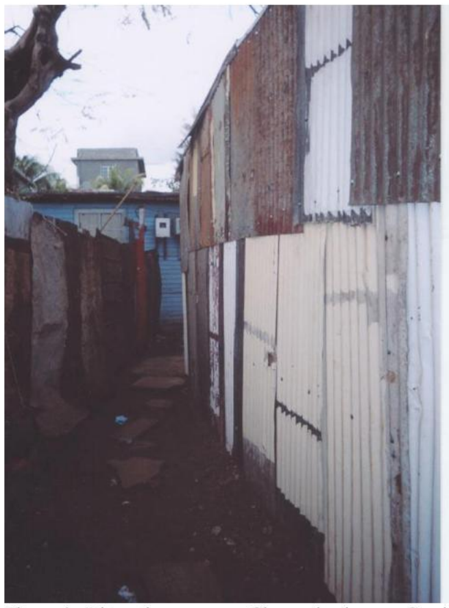
Figure 4. Dirt pathway among Chagossian homes, Cassis, Mauritius. Note fence is at left, side of Chagossian home at right. 2004.