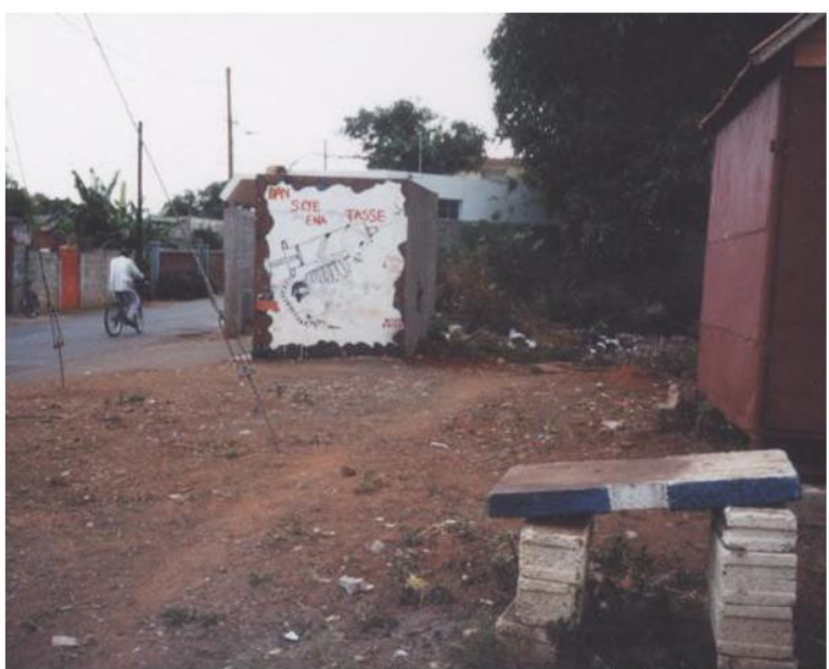
Figure 8. "Even when trying, you're stuck," (old Mauritian Kreol proverb), Roche Bois, Mauritius. 2002.