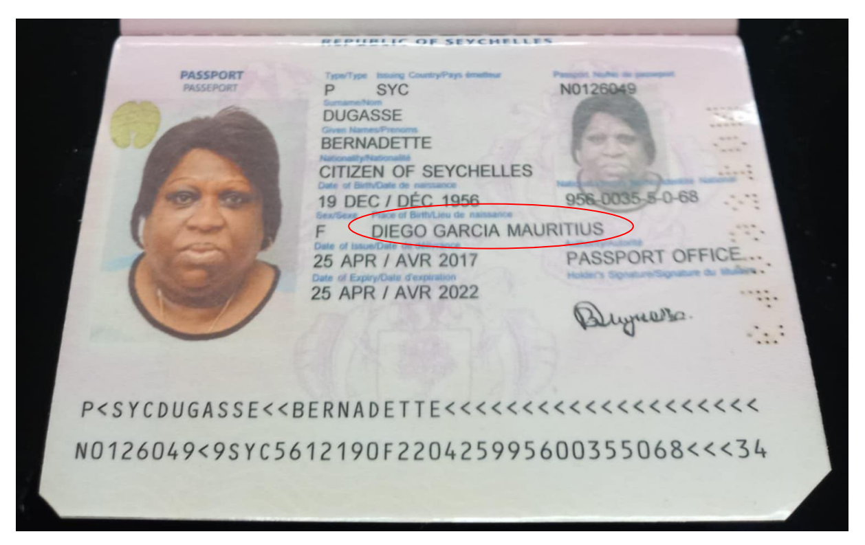
Figure 9. The Seychelles authorities replacing the place of birth Diego Garcia by Mauritius