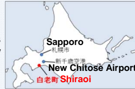
Location of Shiraoi