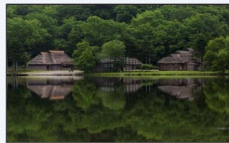
Lake Poroto and traditional Ainu houses