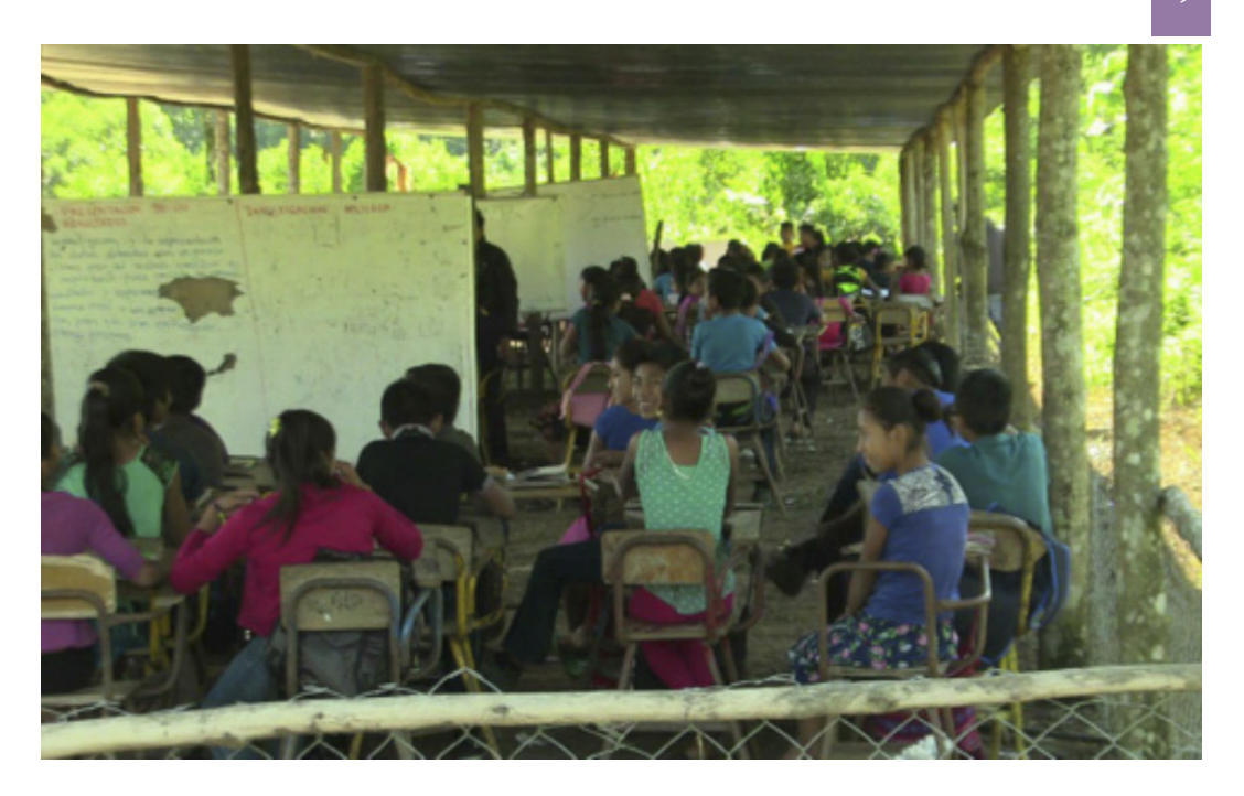
"... Currently more than 200 Mayan Q'eqchi students are taught in a rustic gallery, which has been rebuilt twice by the same community, and worst of all, it lacks desks and blackboards, according to one the five teachers who attend school ... <sup>22</sup> "

On the other hand, in 2014 the career of teaching in primary education was suppressed and with it, the preparation of thousands of indigenous students to become teachers in Intercultural Bilingual Education. That career was replaced by the Bachelor with Orientation in Teaching, a profession that adds two more years to the teaching career (currently requiring five years) and which restricts teaching until three years of studies at university have been completed. This decision transgresses the educational reform processes arising from the Peace Accords, which established the need to expand and promote bilingual education. When establishing a relationship between indigenous persons who complete a mid level education with those that enter university, there are few, historically,